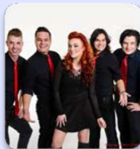
ELECTRIC CIRCUS CONCERT